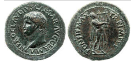
Roman copper alloy coin. Obverse: head of Nero. Reverse: Nero playing lyre as Apollo Citharoedus. BM 1921,0612.5